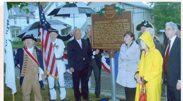
Lafayette Chapter members dedicated an Ohio Historical Marker for the Middlebury Cemetery on October 8, 2008. The first person buried in the cemetery was a Revolutionary War veteran and now six veterans are buried there.