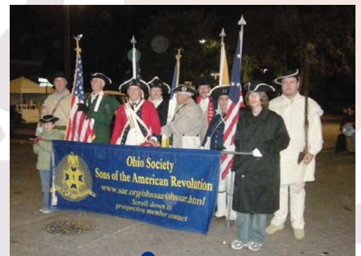
Circleville, Ohio Pumpkin Show Parade, October 17-18, 2008.