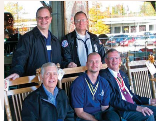
Joint General Henry Knox and Constitution Chapters gathering in Mansfield, Ohio on October 11, 2008.