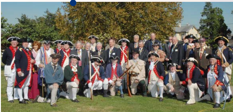
Battle Days at Point Pleasant, West Virginia on October 5, 2008 commemorating the first battle of the American Revolution.