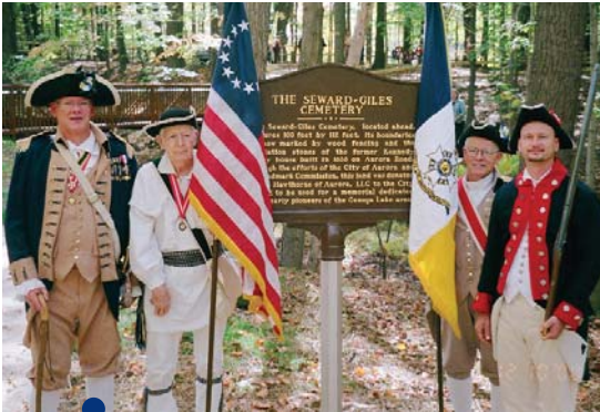
Western Reserve Society Seward-Giles Cemetery dedication in Aurora, Ohio on October 12, 2008.