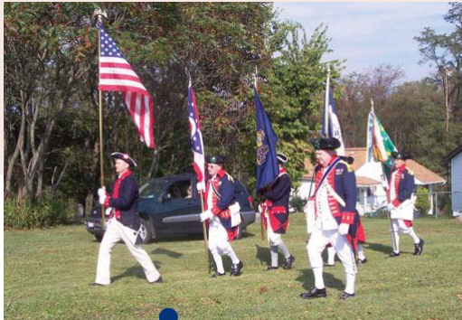
Ebenezer Zane Chapter grave marking ceremony for five Patriots buried at the Two Ridges Presbyterian Church Cemetery in Wintersville, Ohio on September 20, 2008.